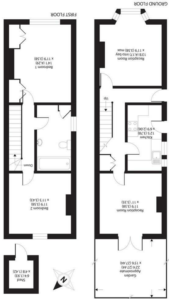
APPROX. GROSS INTERNAL FLOOR AREA 952 SQ FT 88.4 SQ METRES (EXCLUDES SHED)

34 Richmond Road Kingston upon Thames Surrey KT2 5ED www.gibsonlane.co.uk Tel: 020 8546 5444