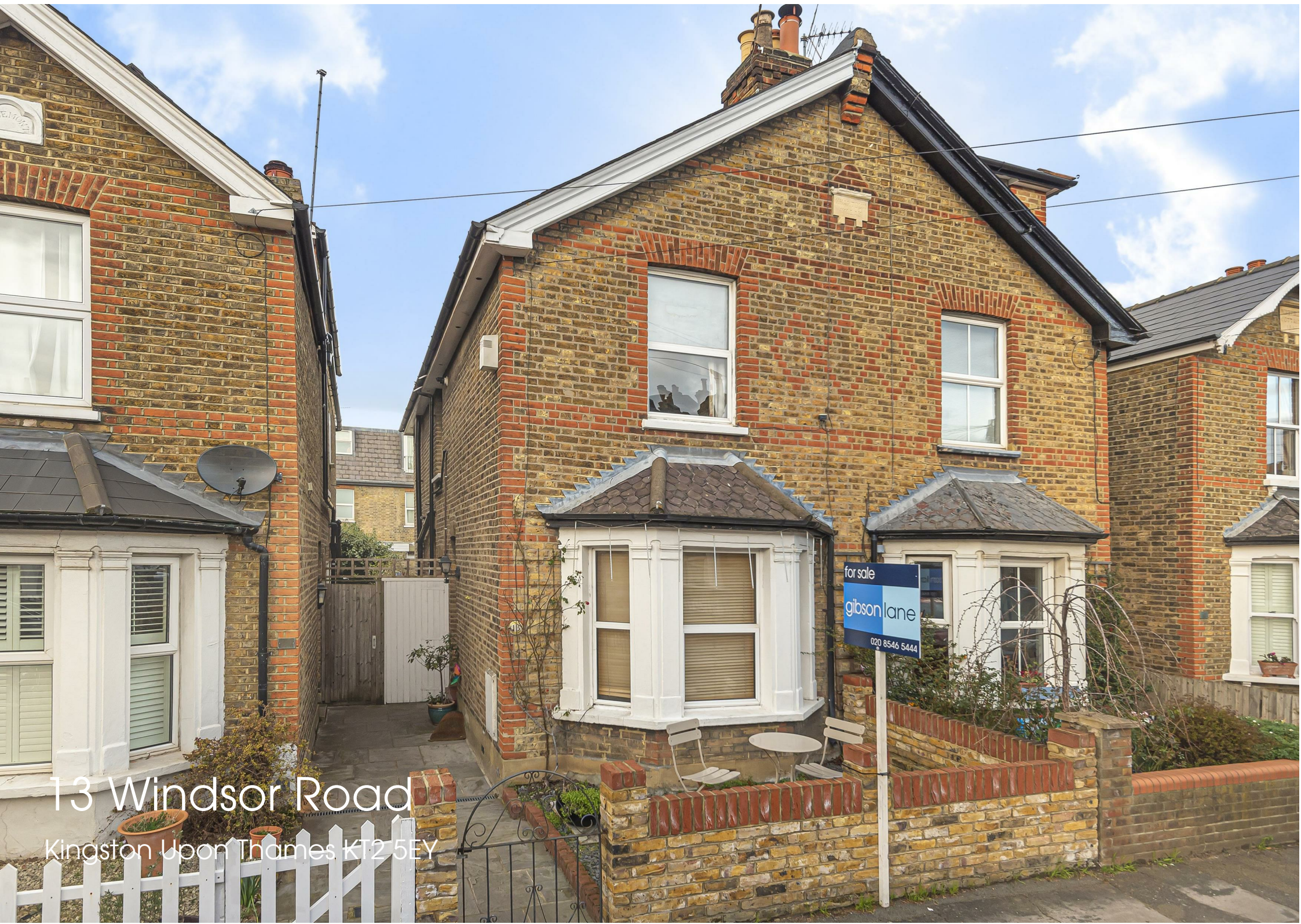
13 Windsor Road Kingston upon Thames KT2 5EY